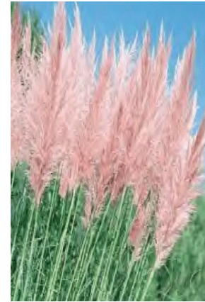
Pink Feather pampas grass

Pampas grass bears male and female flowers on separate plants. The plumes of female plants are broad and full due to silky hairs covering the tiny flowers. They are much showier than the plumes of male plants, which lack silky hairs on their flowers. For that reason, most pampas grass is propagated vegetatively, by dividing a female clump. Propagation from seed can result in genetic variability and the less attractive male form. When propagated from seed, there is no way to know whether the plant is male or female until it flowers.