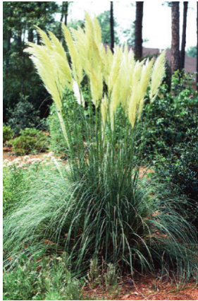
Dwarf pampas grass

Today there are many pampas grass cultivars in the nursery trade. Some have pinkish-white plumes, while others have silvery-white plumes, variegated foliage or a dwarf growth habit. See Table 1 for a list of several common cultivars.