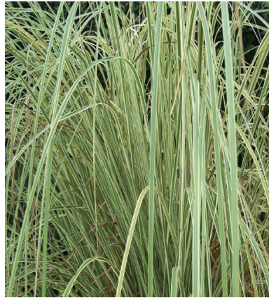
Silver Comet pampas grass