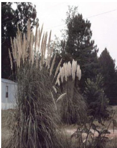
Foreground: male pampas grass Background: female pampas grass

Common pampas grass is hardy in zone 8 (Coastal Plain), and is marginally hardy in zones 6 and 7 (Piedmont region). In the upper Piedmont and mountainous areas of north Georgia, consider planting more cold-hardy cultivars (see Table 1 and Figure 1).